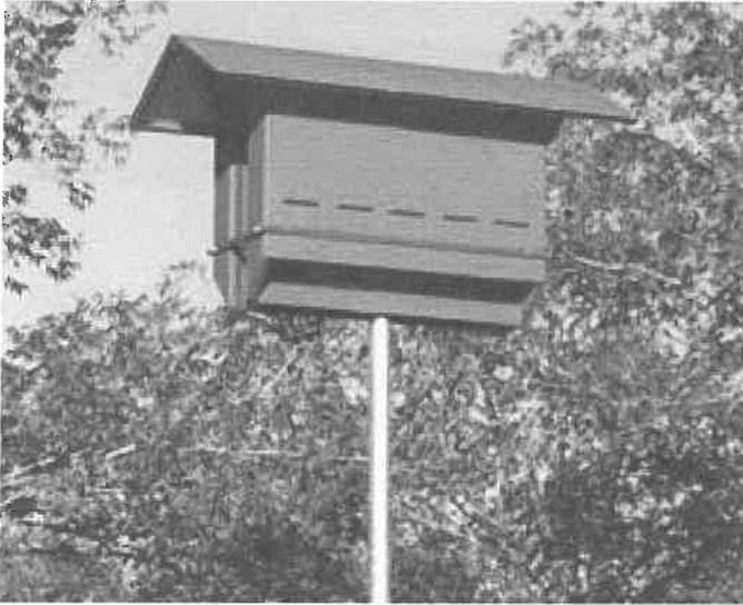
200 bat bathouse