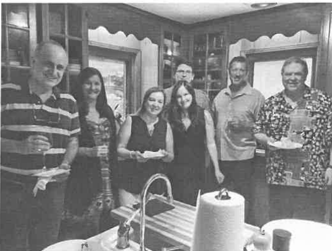
Welcome to our new neighbors!

Would you like to be on our welcome committee? Please sign up by emailing us at BHNAalert@gmail.com .