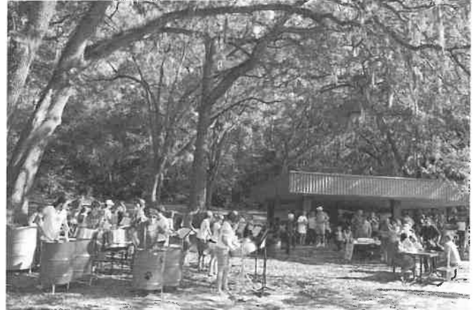
Lion Steel and BHNAers jammin' at a fall Family Pizza Party.

Betton is just full of so many wonderful opportunities. I remain impressed with the number of city parks in our neighborhood for families to enjoy. As always, Winthrop Park is busy with sports and playground fun. Betton is a great family neighborhood. I hope you enjoy the fall season.